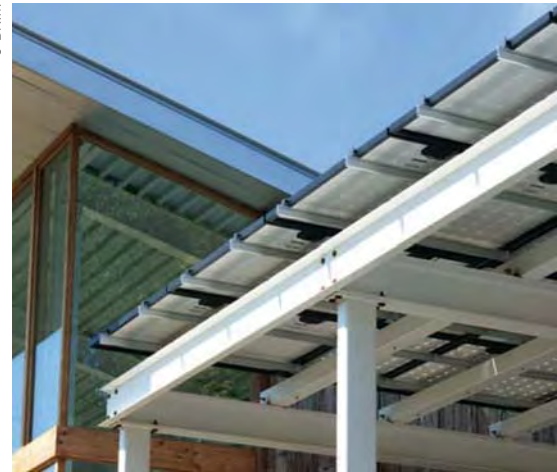
Above A detail of the photovoltaic array at the building's outdoor classroom. More than 100% of the building's annual energy needs are supplied by renewable sources.