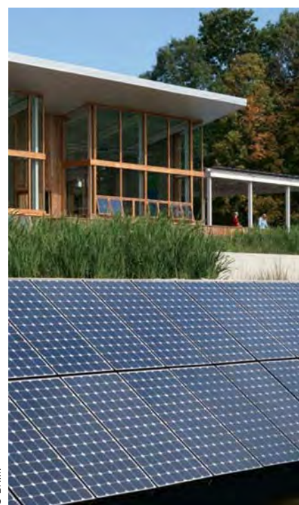
Above Four distinct cells make up the outdoor constructed wetlands, just south of the building. Campus wastewater enters these wetlands early in the cleansing process. This nutrient-rich water ensures a robust landscape for the southern view from the building.