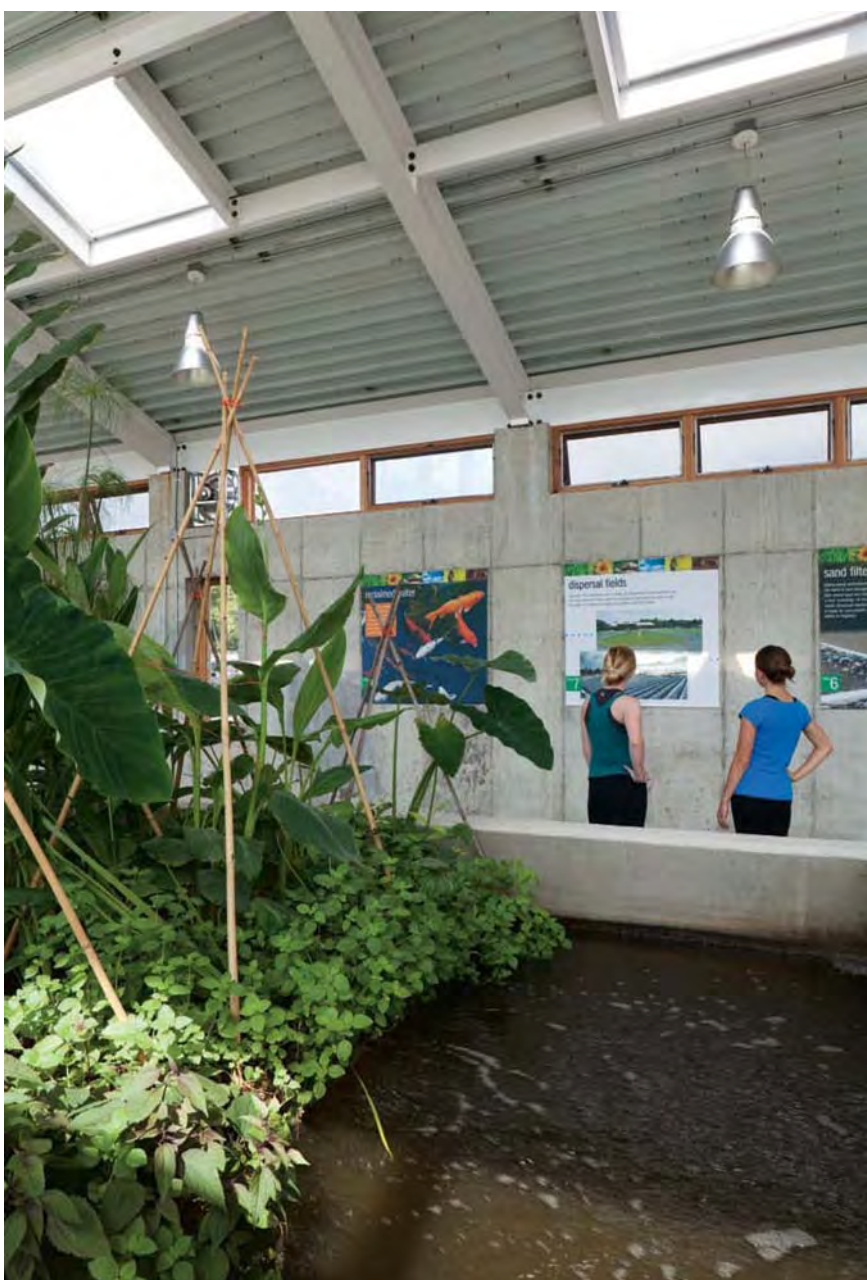
The Eco Machine is on display for all to see, along with educational signage that provides information about the water purification process from toilet to groundwater.

plywood roof and wall sheathing, which was salvaged from the 2009 U.S. Presidential Inaugural Stage. Materials were also sourced to avoid those on the Materials Red List from the Living Building Challenge Guidelines.