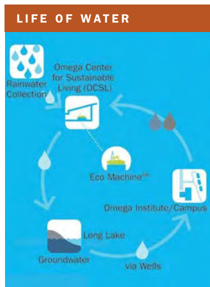
The vision for this facility was to close the loop on water. All water that is used in this building and in all other buildings on campus comes from the sky or from on-site wells, then is returned to the water table after purification.

For potable water uses, well water is still drawn. For toilet flushing, rainwater is collected from the building's roof. Low-flow plumbing fixtures have been installed to minimize water consumption, including waterless urinals in the men's restroom. For all other water use on